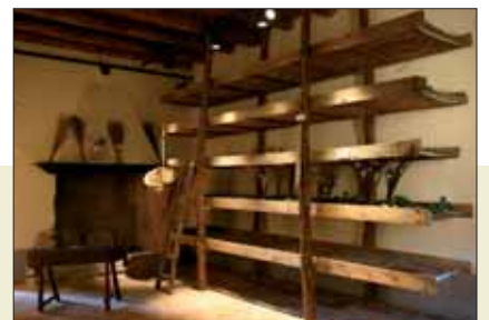
The room of the museum dedicated to silkworm larvae

The MEAB can be characterised as a museum of society, both for the fact that it presents documentary material provided by the local population, and for the fact that it has stimulated a notable involvement by the friends of the MEAB. This is expressed through meetings with upholders of local traditions, conferences, congresses, school activities, educational courses, temporary exhibits, research and publications – both in print and in audio/visual formats – some of which have been widely recognised.