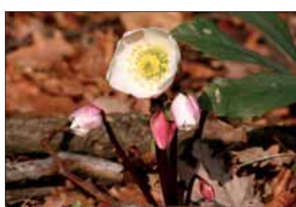
Christmas Rose ( Helleborus niger )