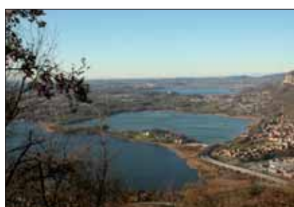
From Barro - The lakes of Brianza