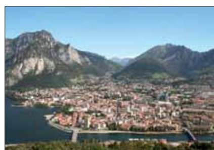
From Barro - The city of Lecco