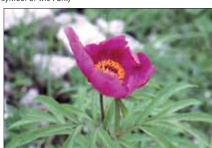
Common Peony ( Paeonia officinalis )