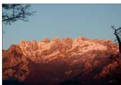
From Barro - Sunset on the Resegone