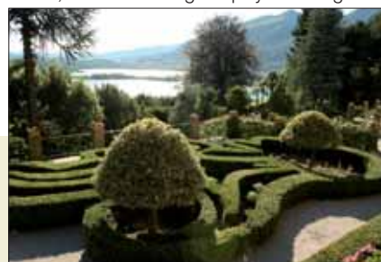
The gardens of Villa Bertarelli

In 2003 the villa was bought by the town hall of Galbiate and by Monte Barro Park, the latter being the owner of a wing of the villa and the gardens. The gardens are an important and charming aspect of the villa, especially for the splendid landscaping and the panorama over the lakes of Brianza. The inclusion of the Native Flora Centre in the villa has involved the maintenance of underground passageways, grottos and the antique glasshouse, and walk-through displays showing how the centre studies and conserves plant biodiversity.