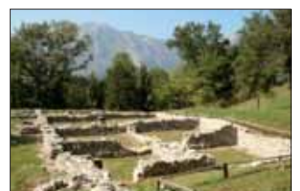
Archaeological Park of Piani di Barra

On the southern flank of the mountain it is also possible to visit a fortified wall, known locally as muraioo , which once enclosed the site and includes three crenulated towers.