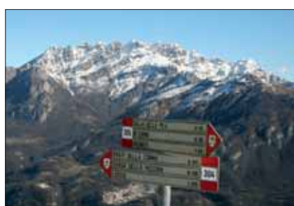
From the peak - Signpost and Monte Resegone