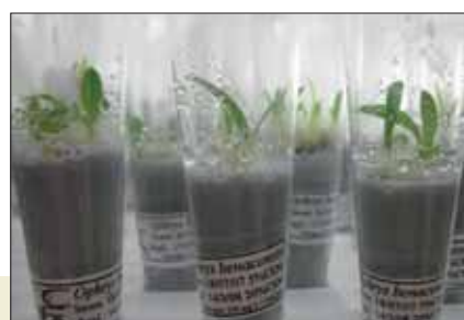
In vitro propagation of rare orchids

The CFA is involved in a range of projects including the floristic recovery of degraded woodland in the lowlands, the production of seed mixtures for the greening of denuded areas (quarries, ski runs, etc.), the production of rare or endangered plant species for population reinforcement and/or reintroduction. The CFA was founded by the park and recognised in 2000 by the Lombardy Region, and now a number of institutions are involved, including the Minoprio Foundation (large-scale cultivation) and the Universities of Insubria (scientific supervision) and Pavia (Seed Bank).