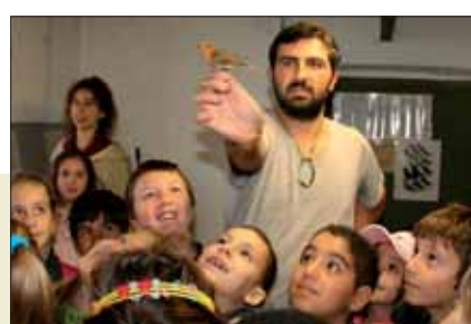
A robin that has just been tagged

The station also carries out studies of nesting birds on Monte Barro and participates in national and international research programmes.