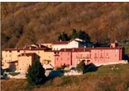
The rural hamlet of Camporeso

Address: Camporeso 23851 Galbiate (LC) Tel.: (39) 0341 240193 - (39) 0341 542266 Fax.: (39) 0341 240216 e-mail: meab@parcobarro.it http://meab.parcobarro.it/ Where it is found: Reference n° 2 on the map