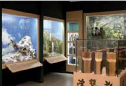
The Park Centre - The environments of the mountain

Where the Park Centre and Archaeological Museum can be found References n° 3 and 4 on the map.