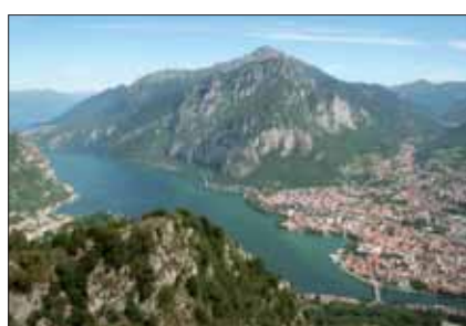
From the peak - Lecco lake