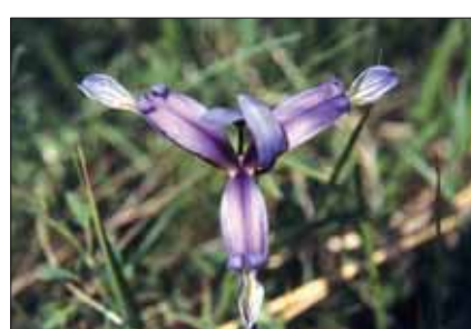
Grass-leaved Flag ( Iris graminea )