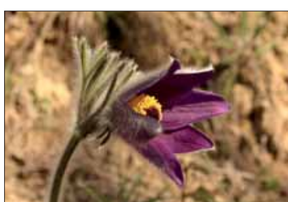
Mountain Pasque Flower ( Pulsatilla montana - adopted symbol of the Park)