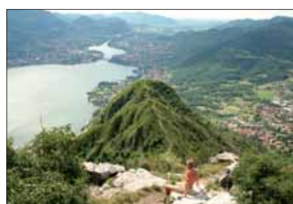
From the peak - Garlate lake and the Valley of the Adda