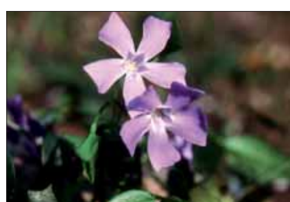
Lesser Periwinkle ( Vinca minor )