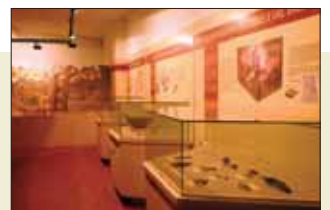
One of the rooms of the Archaeological Museum