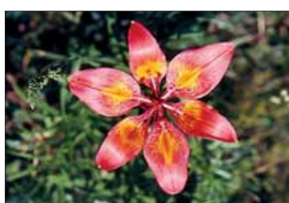
Fire Lily ( Lilium bulbiferum )